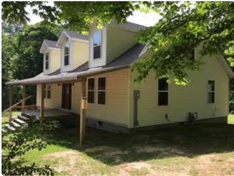
Sketches - Assessor's Office