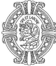
Andre Sayegh' Mayor