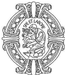
Andre Sayegh' Mayor