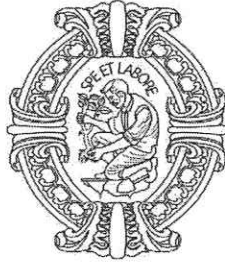
Andre Sayegh' Mayor