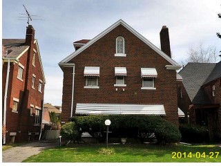
Item 1 of 3 2 Images / 1 Sketch