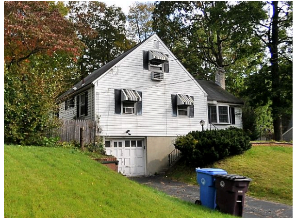
( https://images.vgsi.com/photos/NewBritainCTPhotos/00032742.JPG )