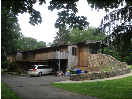
1 2 3