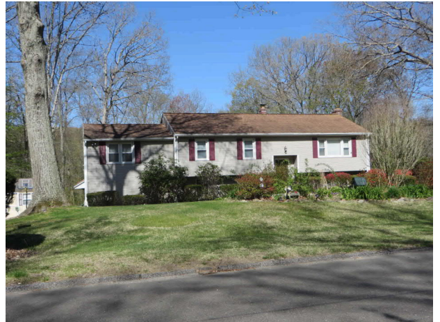
( https://images.vgsi.com/photos/OxfordCTPhotos/\00\01\08\21.jpg )