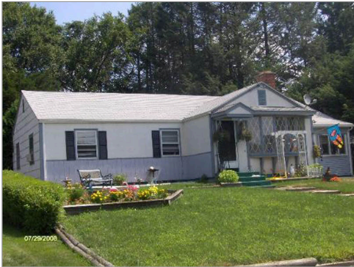
Open enlarged photo