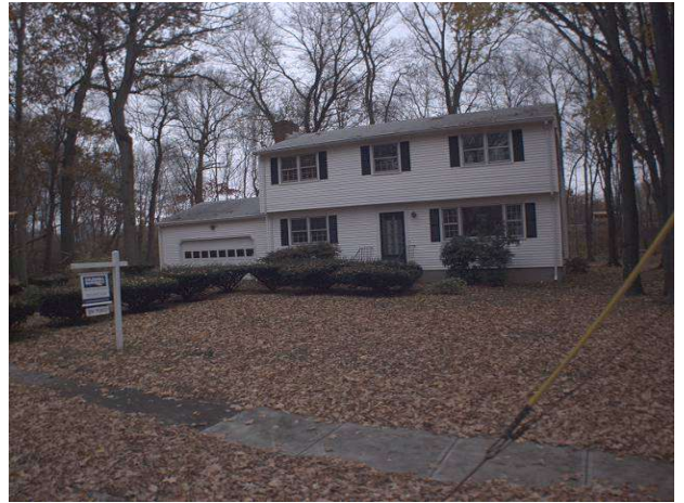
( https://images.vgsi.com/photos/MilfordCTPhotos/A00\04\57\10.JPG )