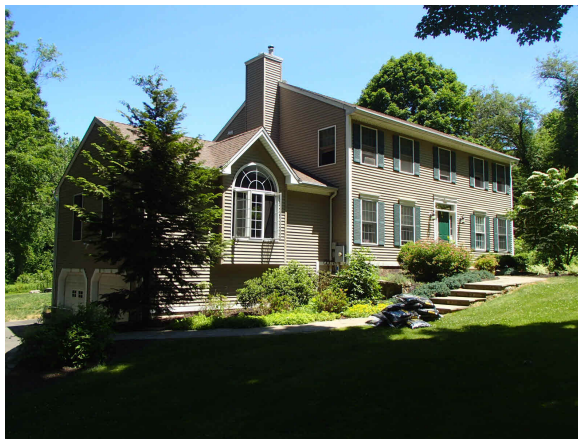
( https://images.vgsi.com/photos/NewtownCTPhotos/A00\01\24\25.jpg )