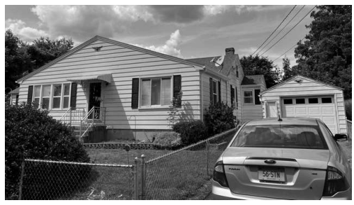
Quick Map Property Card Assessor Tax Map FEMA Panel

MAILING ADDRESS 1 CHESEBRO LA STONINGTON CT 06378