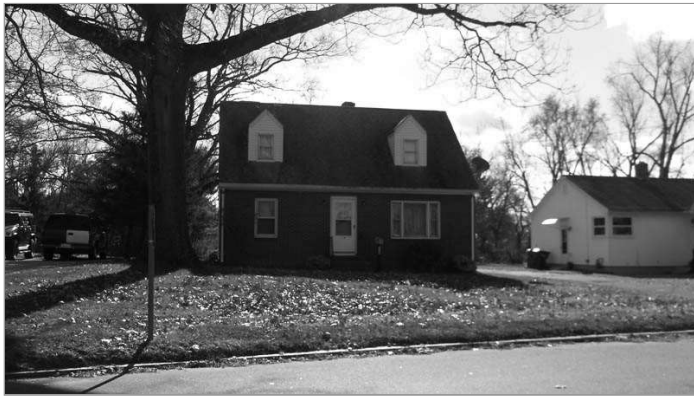
Open enlarged photo