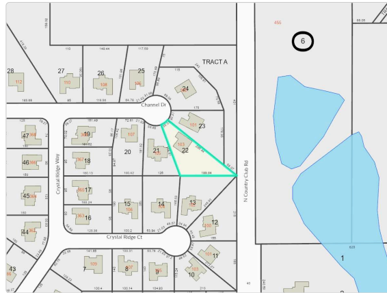
Map - Parcel View

DAVIS, YOLANDA J; WILLIAMS, JEANNETTE S; DAVIS, ANTHONY G 2024 Market $465,798 Assessed $317,517 2023 Tax Bill $3,655.62 Tax Savings with Exemptions/Cap $1,959.95