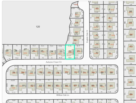
Map - Parcel View

2023 Tax Bill $2,449.51 Tax Savings with Exemptions $3,507.74