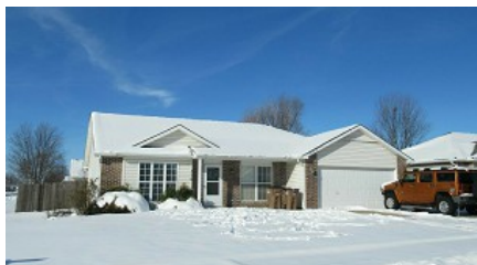
Pin 04-05-21-000-000-473.000 Photo

BROOKSIDE 2ND PLAT LOT 72 (NOT TO BE USED ON LEGAL DOCUMENTS)