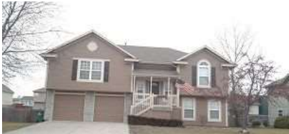
Pin 04-04-17-000-000-172.000 Photo

Parcel Number: 04-04-17-000-000-172.000 Computer ID: 2323390 Deed Holder: ROMEO HOMES KANSAS LLC Property Address: 1604 TYLER DR RAYMORE, MO 64083-0000 MAP THIS ADDRESS Mailing Address: 103 FOULK RD, STE 900 WILMINGTON, DE 19803-0000 USA Class: RESIDENTIAL Map Area: RMORE FOXHAVEN Plat Map: 3786/466 Subdivision: FOXHAVEN 12TH Sec-Twp-Rng: 17-46-32 Lot-Block: 324- Brief Legal Description: FOXHAVEN 12TH PLAT LOT 324 (NOT TO BE USED ON LEGAL DOCUMENTS)