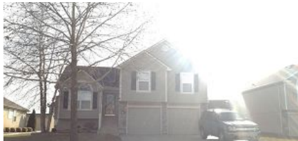
Pin 04-05-21-000-000-552.000 Photo

BROOKSIDE 3RD PLAT LOT 113 (NOT TO BE USED ON LEGAL DOCUMENTS)