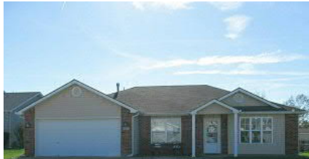
Pin 04-05-21-000-000-005.097 Photo

Parcel Number: 04-05-21-000-000-005.097 Computer ID: 2326713 Deed Holder: ROMEO HOMES KANSAS LLC Property Address: 733 CARLISLE DR RAYMORE, MO 64083-0000 MAP THIS ADDRESS Mailing Address: 103 FOULK RD, STE 900 WILMINGTON, DE 19803-0000 USA Class: RESIDENTIAL Map Area: RMORE BROOKSIDE Plat Map: 3794/764 Subdivision: BROOKSIDE 7TH Sec-Twp-Rng: 21-46-32 Lot-Block: 274- Brief Legal Description: BROOKSIDE 7TH PLAT LOT 274 (NOT TO BE USED ON LEGAL DOCUMENTS)