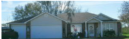
Pin 04-05-21-000-000-005.114 Photo

Parcel Number: 04-05-21-000-000-005.114 Computer ID: 2326730 Deed Holder: ROMEO HOMES KANSAS LLC Property Address: 1015 BRISTOL DR RAYMORE, MO 64083-0000 MAP THIS ADDRESS Mailing Address: 103 FOULK RD, STE 900 WILMINGTON, DE 19803-0000 USA Class: RESIDENTIAL Map Area: RMORE BROOKSIDE Plat Map: 3795/168 Subdivision: BROOKSIDE 7TH Sec-Twp-Rng: 21-46-32 Lot-Block: 297- Brief Legal Description: BROOKSIDE 7TH PLAT LOT 297 (NOT TO BE USED ON LEGAL DOCUMENTS)