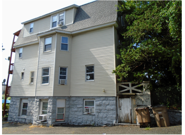
( https://images.vgsi.com/photos/StamfordCTPhotos//0147\DSC01203_147 )