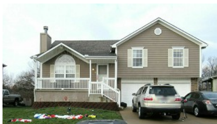
Pin 04-05-21-000-000-379.000 Photo

Parcel Number: 04-05-21-000-000-379.000 Computer ID: 2326979 Deed Holder: ROMEO HOMES KANSAS LLC Property Address: 814 CANTER ST RAYMORE, MO 64083-0000 MAP THIS ADDRESS Mailing Address: 103 FOULK RD, STE 900 WILMINGTON, DE 19803-0000 USA Class: RESIDENTIAL Map Area: RMORE CANTER RIDGE Plat Map: 3801/87 Subdivision: CANTER RIDGE 7TH Sec-Twp-Rng: 21-46-32 Lot-Block: 80- Brief Legal Description: CANTER RIDGE 7TH PLAT LOT 80 (NOT TO BE USED ON LEGAL DOCUMENTS)