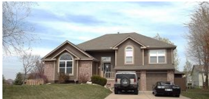
Pin 04-02-09-000-000-095.000 Photo

Parcel Number: 04-02-09-000-000-095.000 Computer ID: 2229054 Deed Holder: ROMEO HOMES KANSAS LLC Property Address: 1114 TUDOR DR RAYMORE, MO 64083-0000 MAP THIS ADDRESS Mailing Address: 103 FOULK RD, STE 900 WILMINGTON, DE 19803-0000 USA Class: RESIDENTIAL Map Area: RMORE REMINGTON Plat Map: 3806/462 Subdivision: REMINGTON 1ST Sec-Twp-Rng: 09-46-32 Lot-Block: 45- Brief Legal Description: REMINGTON 1ST PLAT LOT 45 (NOT TO BE USED ON LEGAL DOCUMENTS)