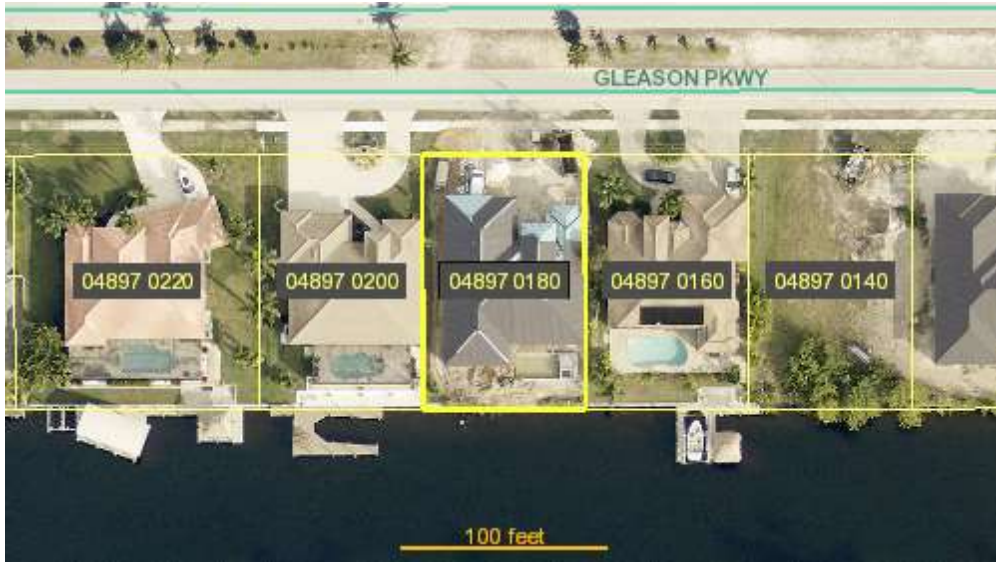
[ Pictometry Aerial Viewer ]