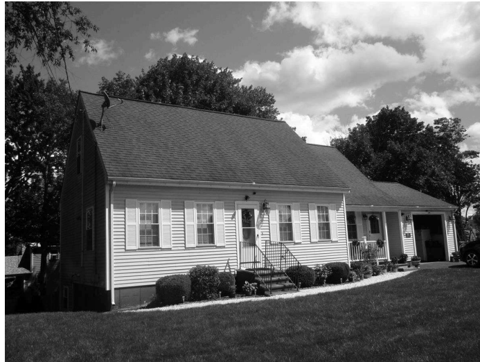
1 2 3