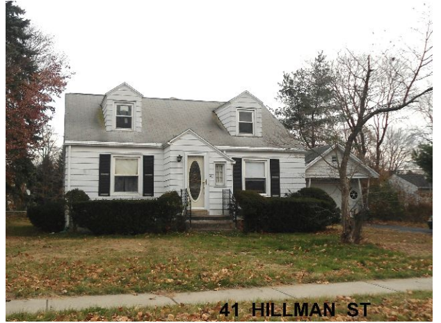
( https://images.vgsi.com/photos2/ChicopeeMAPhotos/\00\00\53\57.JPG )