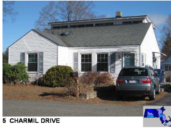
5 CHARMIL DRIVE

( https://images.vgsi.com/photos2/WestBrookfieldMAPPhotos/A00\00\08\92.J )