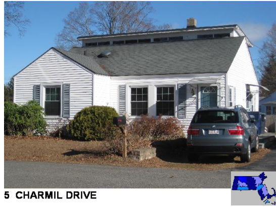
5 CHARMIL DRIVE

( https://images.vgsi.com/photos2/WestBrookfieldMAPPhotos/A00\00\08\92.J )