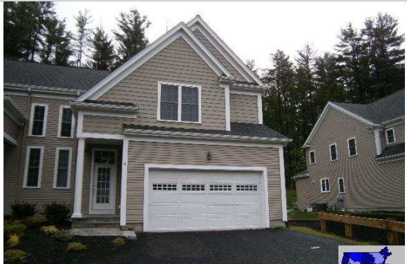
5 CYRUS WAY