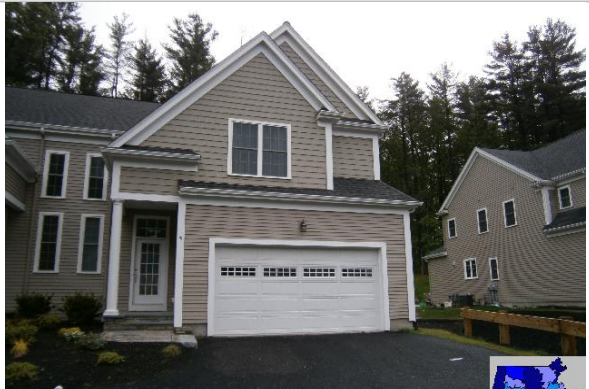
5 CYRUS WAY