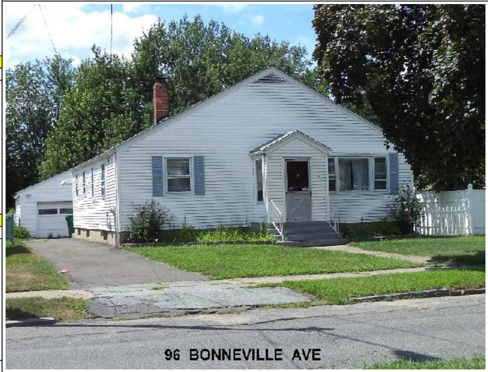
96 BONNEVILLE AVE