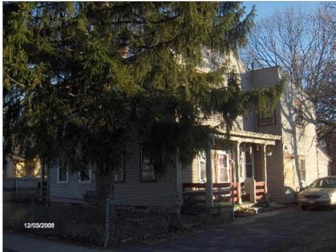
Open enlarged photo