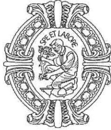
Andre Sayegh' Mayor