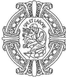
Andre Sayegh' Mayor