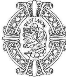
Andre Sayegh' Mayor