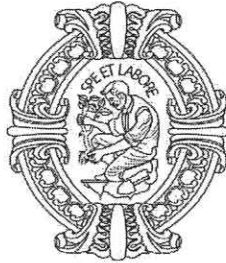
Andre Sayegh' Mayor