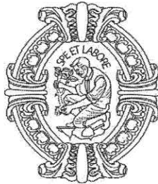
Andre Sayegh' Mayor