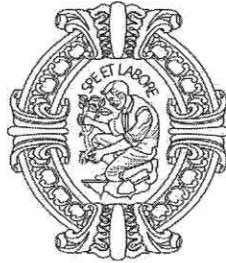
Andre Sayegh' Mayor